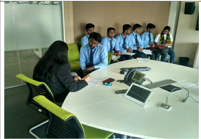
Life Skill training Program Conducted by Rubicon Skill Development and Barclays, Pune