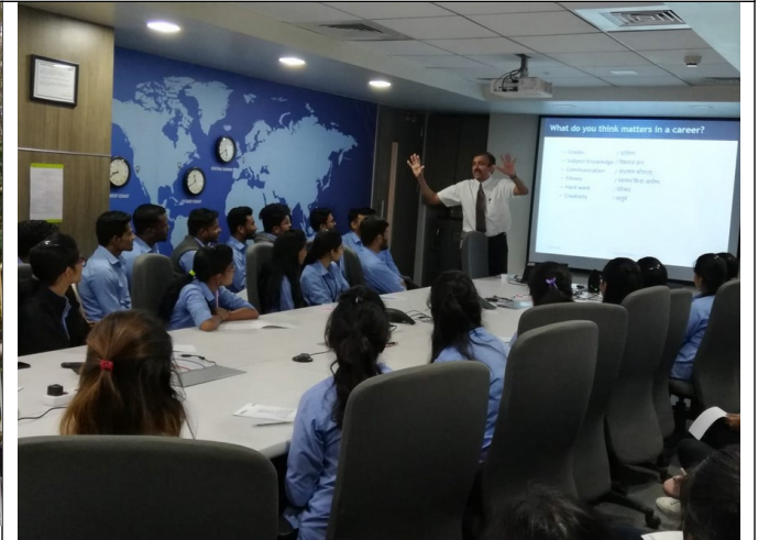
Cytel Statistical Software & Services Pvt. Ltd., Pune