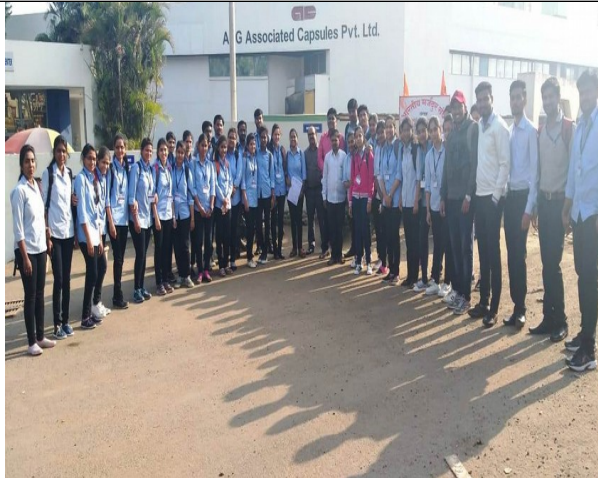
ACG Associated Capsules Pvt Ltd (ACPL), Satara