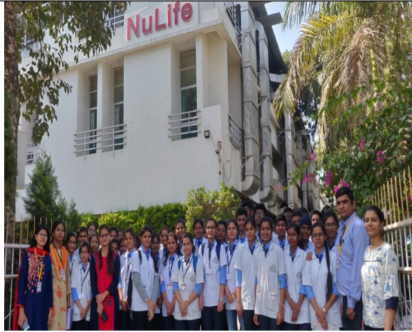
Nulife Pharmaceuticals, Pune