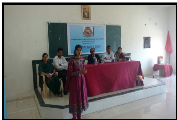
Alumni meet organized in Seminar Hall