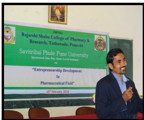
One Day Seminar organized in Seminar Hall