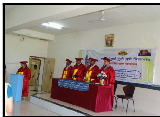
Convocation ceremony in Seminar Hall