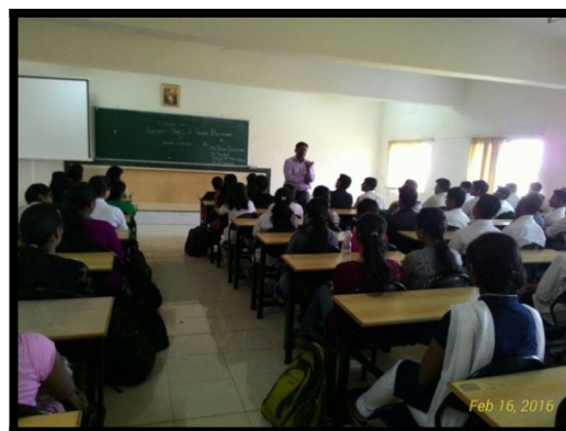
Guest lecture conducted in Seminar Hall