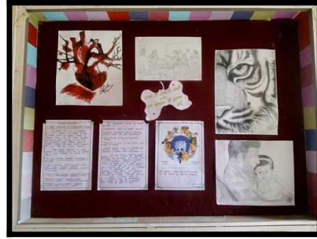
Zing Corner- A Wall Magazine