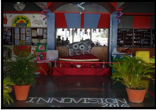
Innovation- A Technical Symposium