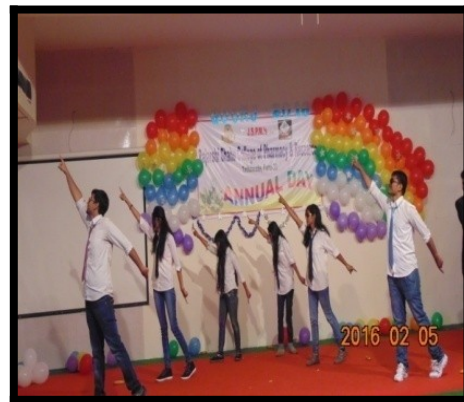
Annual Day celebrated in Auditorium