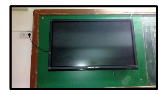
Digital Smart Board

Spacious, well-lit and well-ventilated 6 classrooms and 1 Seminar Hall with comfortable seating arrangement are available for smooth conduct of B. Pharm. and M. Pharm theory sessions. Besides the conventional teaching aids, classrooms are also equipped with state-of-the-art audiovisual technology viz. Digital smart board, LCD projectors and Over Head Projectors, thus stepping up the teaching-learning experience to next higher level. Well-thought positioning of aisle in the classrooms ensures proper interaction between teacher and students.