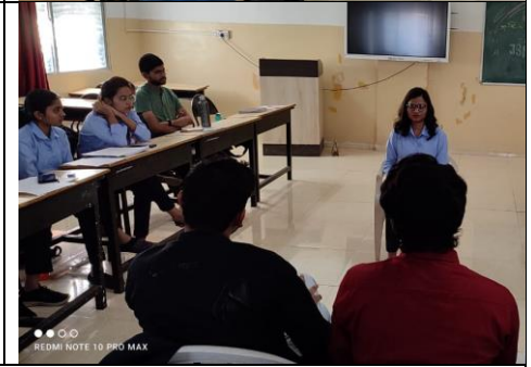
Glimpses of active participation of students in training modules conducted in this program