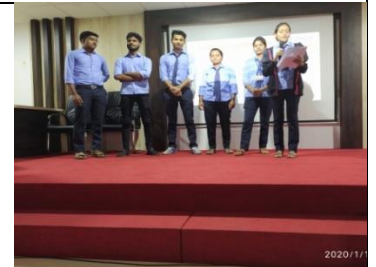
Glimpses of active participation of students in training modules conducted in this program