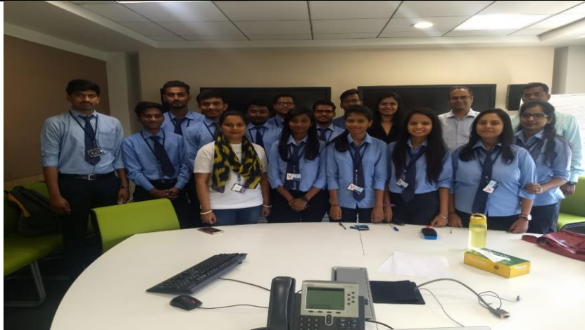
Final year B Pharm students at Barclays, for Life Skills Training