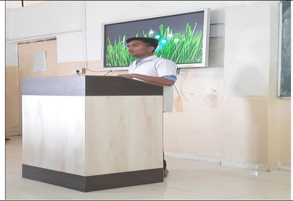
Smart board implementation in classroom