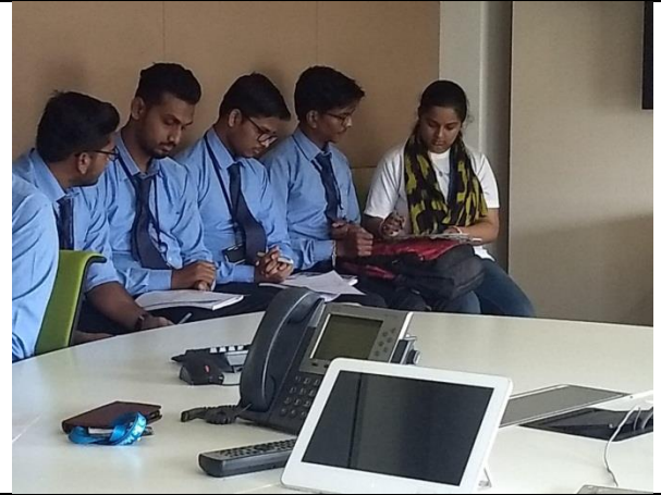
A presentation on Life Skills training was delivered by Corporate trainer, Barclays