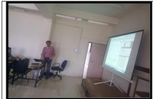
Class Room with LCD Projector