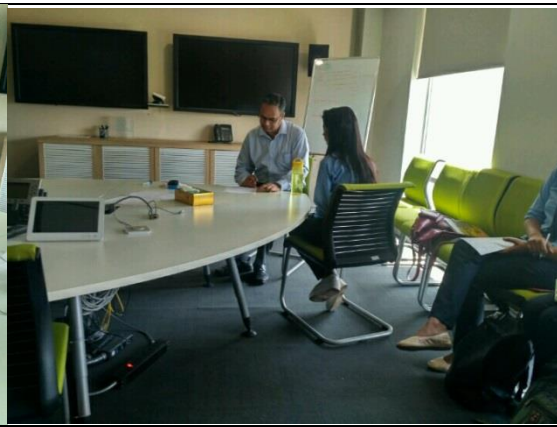
Training and to students with corporate trainers, Barclays